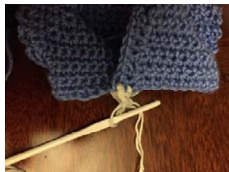
2 overlapping stitches

This next row joins the dress at the waist, overlapping the 2 buttonhole rows with the 1 st 2 sts of row 12.