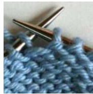
Step 3: Return the slipped stitch to the left needle