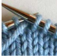
Step 2 Bring the working yarn to the back