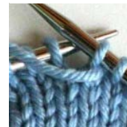
Step 4: Turn your work to begin the next (K) row

Normally you would ‘pick up’ the wrapped stitch on the next row, but that is not necessary for this pattern.