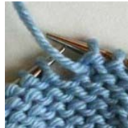
Step 1: Slip the next stitch purlwise