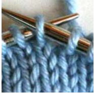
Step 1 Slip the next stitch purlwise