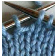
Step 4 Turn the work to begin then next (P) row