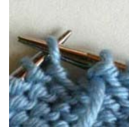
Step 2: Bring the working yarn to the back