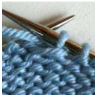
Step 3 Return the slipped stitch to the left needle